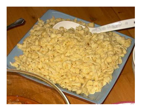
galuska (Hungarian dumpling)